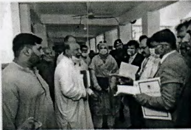
■ OUR CORRESPONDENT ISLAMABAD